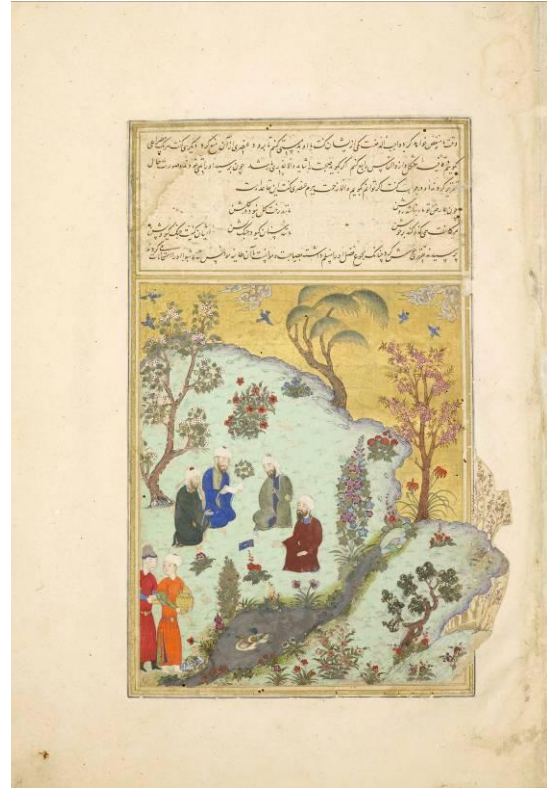
Firdausi encounters the court poets of Ghazni, c. 1440s. Ink, opaque watercolor, and gold on paper. H. 6.4 x W. 6 in. (H. 16.3 x W. 15 cm). Royal Asiatic Society of Great Britain and Ireland, MS. 239, 7a.

Juki's Shahnamah boasts sumptuous colors, striking compositions and elegant calligraphy. The manuscript contains thirty-two miniatures created by several different hands as well as two pages of intricate textual illumination, all of which are on view in the exhibition. As is typical in court painting from Iran in this period, the influence of both native and foreign traditions is seen in the style of the illustrations. For example, landscape elements derived from Chinese painting appear in the stylized rock and mountain formations, while Chinese influence is also found in the depiction of clouds and flames.